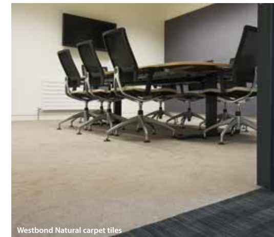
Westbond Natural carpet tiles

The use of Forbo’s Marmoleum with its outstanding levels of flexibility and durability meant that these objectives could be fully realised from the ground up. Both the main building and the combined students’ union and sports centre have achieved a BREEAM rating of “excellent” – becoming one of only a handful of universities in the UK to do so.