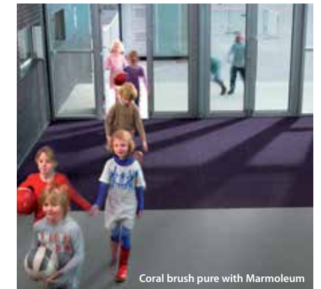
Coral brush pure with Marmoleum